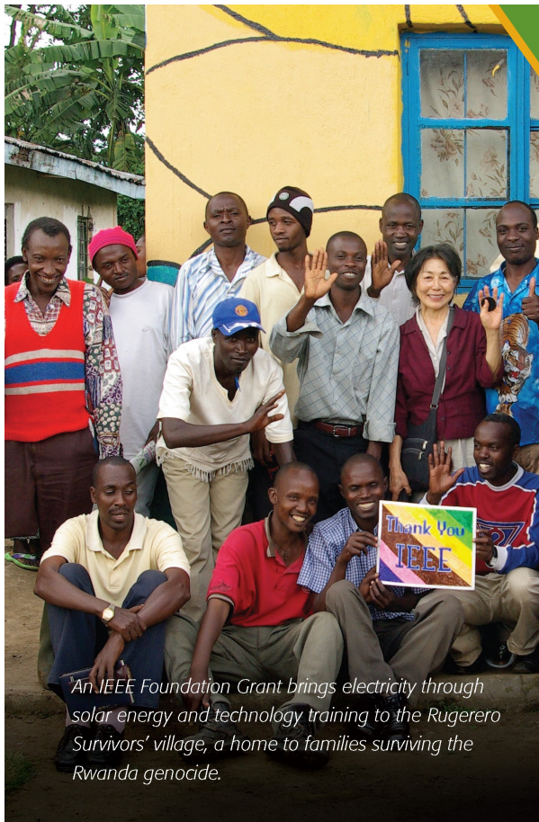
An IEEE Foundation Grant brings electricity through solar energy and technology training to the Rugerero Survivors' village, a home to families surviving the Rwanda genocide.