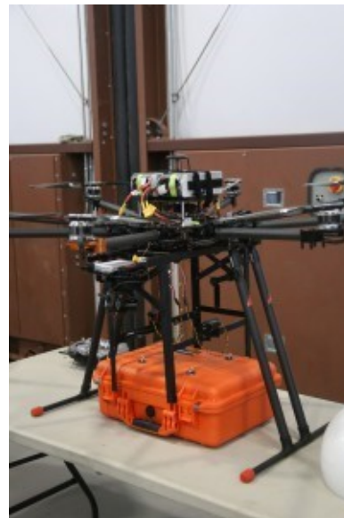
An Unmanned Aerial Vehicle, popularly known as a drone, is equipped with a telemedical package as part of the Telemedical Drone Project, known as HiRO.