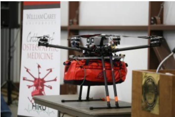
An Unmanned Aerial Vehicle, popularly known as a drone, is equipped with a telemedical package as part of the Telemedical Drone Project, known as HiRO.

https://www.youtube.com/watch?v=3w0wqqO2v1U