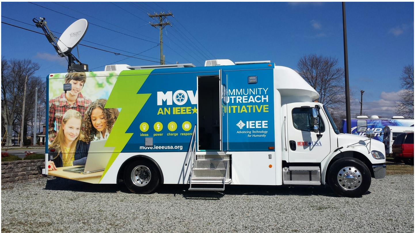
The MOVE truck

The concept of a mobile disaster relief vehicle was